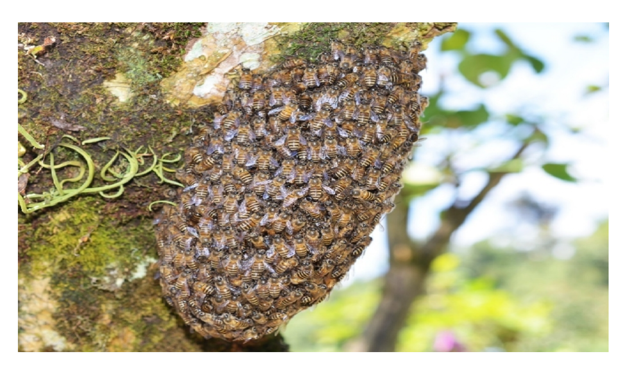
Fig. 4. Temporary swarm of Apis cerana resting on the tree trunk, Ganglakha, Chhukha.