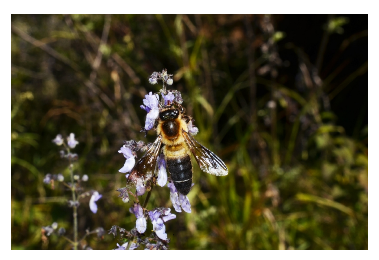
Fig. 2. Apis laboriosa feeding on flower, from Wangsisina, Thimphu.

Apis mellifera Linnaeus, 1758 (The Western or European Honey Bee; Fig. 3)