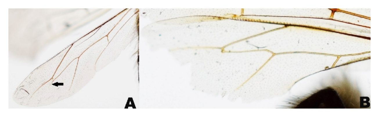
Fig. 6. Hind wings of representative Apis species depicting presence or absence of abscissa of vein-M (arrow): A – A. cerana, B – A. mellifera.

1a. Distal abscissa of vein-M in hind wing present (Fig. 6, A). -----2 1b. Distal abscissa of vein-M in hind wing absent (Fig. 6, B). -----4 2a. All abdominal tergites black; 17-19.5 mm (Fig. 7. B). ----- A. laboriosa 2b. Abdominal terga not as above. -----3 3a. Abdominal terga I-III/IV wholly orange yellow; 17.8-18.5 mm (Fig. 7, A). -------------------A. dorsata 3b. Moderate size; abdominal terga I-III partly or completely black (Fig. 7, C). ------A. cerana 4a. Mesoscutum black; forewing 6-7 mm; mean worker small size 8.1 mm; open nesting. -----5 4b. Mesoscutum light to dark brown; worker moderate size; forewing 7.5-10 mm; cavity nesting (Fig. 7, D). ----- A. mellifera 5a. Metatibia and dorsolateral margin of metabasitarsus with black sitae; metasomal terga I & II black (Fig. 7, F). ------A. andreniformis Metatibia and dorsolateral margin of metabasitarsus with white sitae; metasomal terga I-II reddish orange (Fig. 7, E). ----- A. florea.