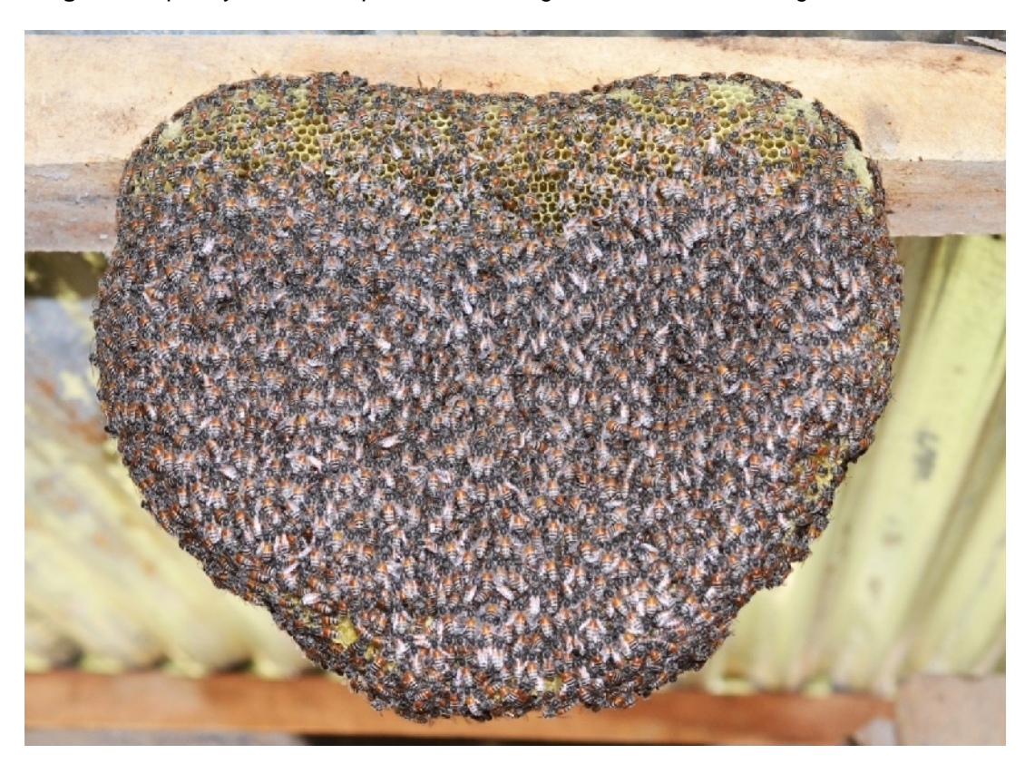
Fig. 5. Hive of Apis florea from Sonamthang, Zhemgang.