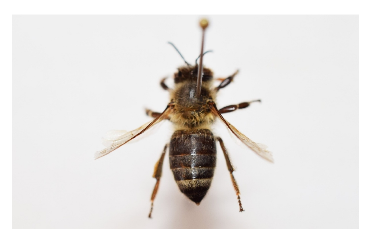
Fig. 3. Habitus of Apis mellifera from Lamai Gonpa, Bumthang.

Gatshel (26.8355N, 91.2494E, Alt. 133 m): 1 collected by Tshering Nidup, Phurpa Dorji & Thinley Gyeltshen on 11.v.2015 from Nganglam Lake; Nganglam, Pema Gatshel (26.82N, 91.23E, Alt. 720 m): 1 collected by Tshering Nidup, Phurpa Dorji & Thinley Gyeltshen on 14.iv.2016 from Deezama village; Nganglam, Pema Gatshel (26.82N, 91.24E, Alt. 349 m): 1 collected by Tshering Nidup, Phurpa Dorji & Thinley Gyeltshen on 18.iv.2016 from Alabari village; Panbang, Zhemgang (26.84N, 90.94E, Alt. 113 m): 2 collected by Tshering Nidup, Phurpa Dorji & Gyeltshen 17.iv.2016 Thinley on Andhalathang; Panbang, Zhemgang (26.84N, 90.99E, Alt. 390 m): 1 collected by Phurpa Dorji, Thinley Gyeltshen & Tshering Nidup on 15.iv.2016 from Klawagang stream; Bumdeling Lower Secondary School, Trashi Yangtse (27.65N, 91.45E, Alt. 390 m): 2 & 1 collected by Tshering Nidup on 01.v.2016 from School Khaling, campus; Trashigang (91.6033E, 27.2058N, Alt. 2073 m): 2 collected by Tshering Nidup & Phurpa Dorji on 01.i.2015 from Khaling village; Ganglakha, Chhukha (26.91N, 89.47E, Alt.